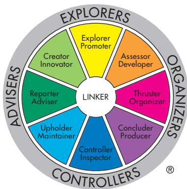
Team Management Wheel

Understand how you like to work, and how this may differ from others you work with.