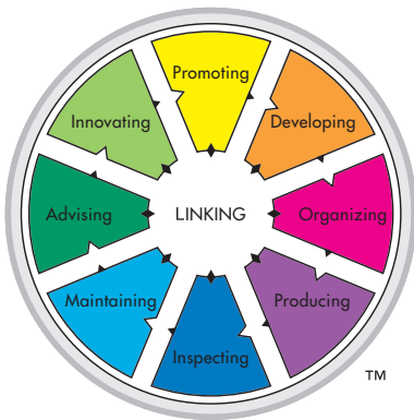
Types of Work Wheel

The Team Management Profile (TMP) is not just about psychometrics, it's about learning. Constructive, work-focused feedback helps individuals understand why they work the way they do, and how they can develop strategies to improve the way they work with others. It provides individuals with a common language and allows team members to recognise each other's strengths in the workplace. When used effectively, the TMP can improve performance at all levels of an organization, enabling positive, lasting change.